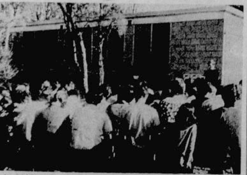
Archbishop Sambell, of Perth, dedicates a new block at the League of Youth Camp, Kalamunda, W.A.

The Perth C.M.S. League of Youth is very proud of the $10,000 additions to its Kalamunda campsite, dedicated by Archbishop Sambell last month.