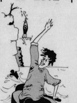
Love is being where you are needed.