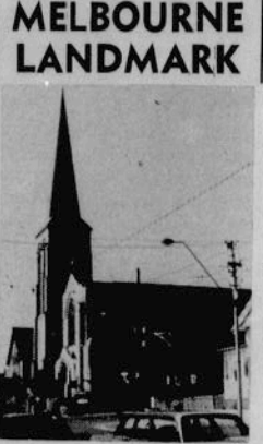
St. Mark's Camberwell raises its spire above the traffic of a busy Melbourne thoroughfare.