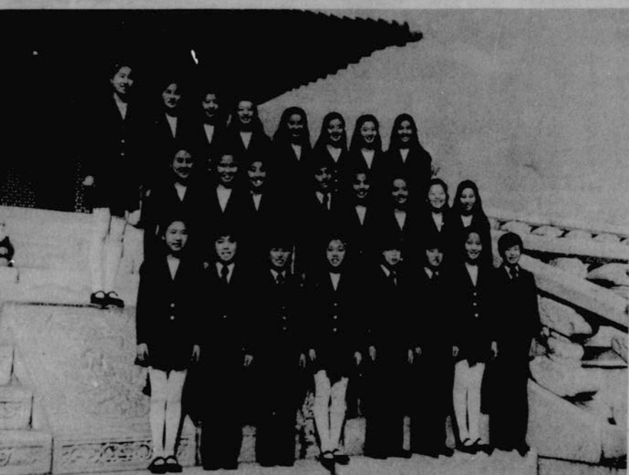
The Korean Children's Choir commences a tour of major Australian cities this month. The choir of twenty-five singers and nine dancers aged from nine to seventeen, sponsored by World Vision, from orphans and children of destitute families, was founded in 1957.

"English Synod much impressed by what Cardinal Hume said"