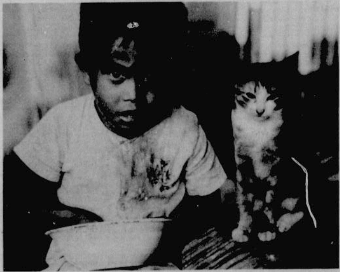
At Kam Phut Refugee Camp in Thailand this small boy makes the most of the rice in his bowl. For a young Kampuchean (Cambodian) refugee who knows what the future will bring?