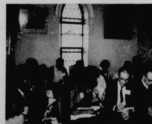
Members of one of the workshops busy thinking or writing during a practice session.

The rest of the afternoon was given to four workshops on writing devotional articles, for youth, for radio and TV and for women. People chose which of